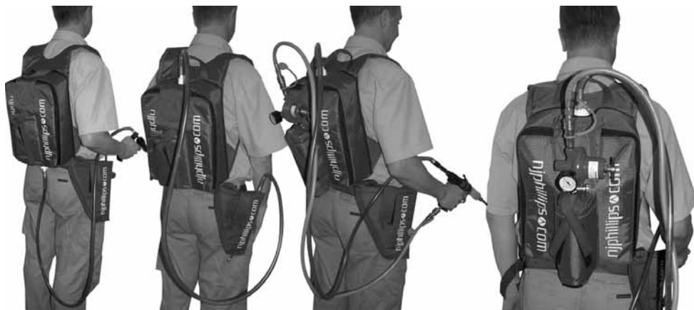
CONTAINER IN INVERTED POSITION